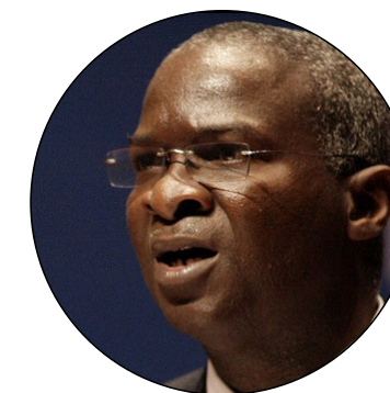
Babatunde Fashola Former Minister of Works and Housing, recognized in 2025 for infrastructure consultancy and public-sector leadership mentoring.