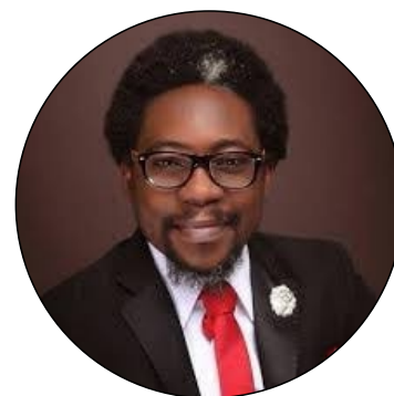
Segun Awosanya (Segalink)

Nigerian striker for Galatasaray SK, whose 2025 performance and philanthropic outreach continue to inspire millions across Africa and Europe.