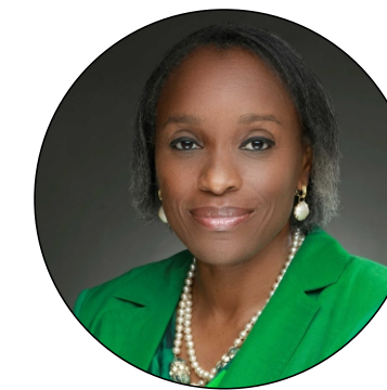
Omobola Johnson Former Minister of Communication Technology and current Senior Partner at TLcom Capital, leading major investments in Africa's digital-innovation ecosystem in 2025.