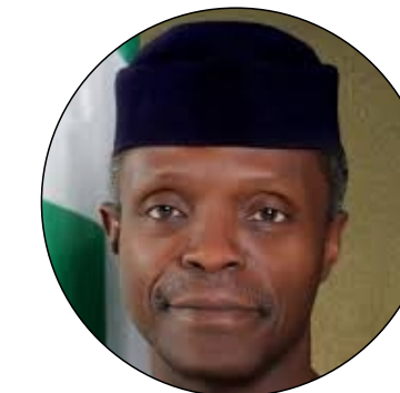
Yemi Osinbajo Former Vice President and founder of Future Perspectives, fostering youth leadership and ethical governance initiatives.