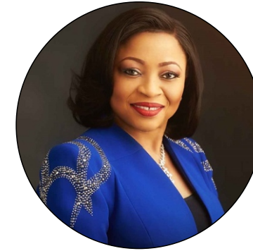
Folorunsho Alakija Billionaire entrepreneur and philanthropist supporting women's empowerment and creative industries through the Rose of Sharon Foundation.