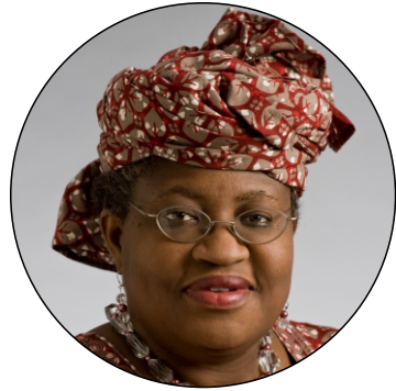
Ngozi Okonjo-Iweala Director-General of the World Trade Organization, advancing fair trade and digital inclusion for African economies.