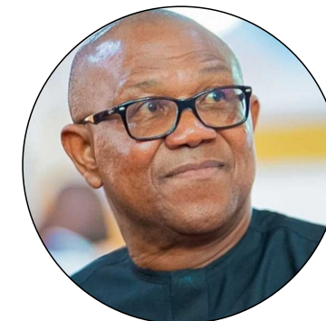
Peter Obi Former governor and political reform advocate whose thought leadership on governance accountability remained widely followed in 2025.