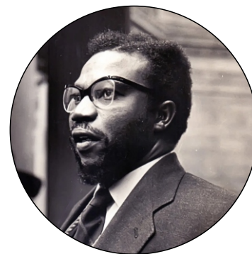
Ben Enwonwu Foundation

Producer and Mavin Records founder nurturing Afrobeats' next global generation in 2025.