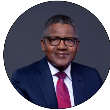
Aliko Dangote Africa's richest man, whose Dangote Refinery and industrial projects continued to redefine Nigeria's economic landscape in 2025.