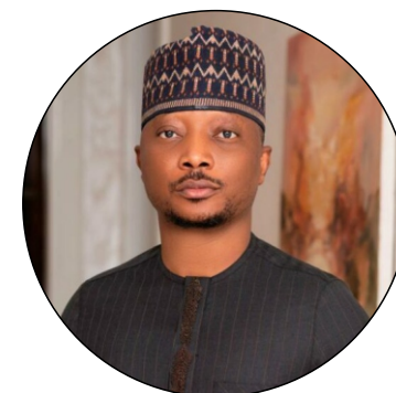
Seyi Adekunle (Seyi Vodi)

Award-winning novelist whose 2025 literary projects expanded narratives on migration and womanhood. (theguardian.com)