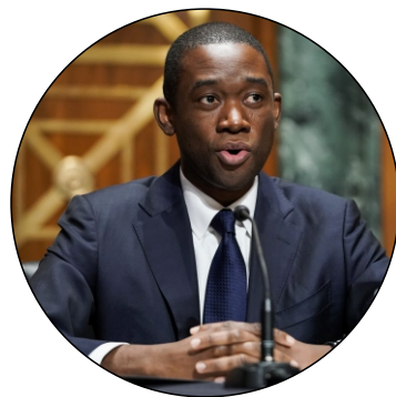
Adewale Adeyemo U.S. Deputy Secretary of the Treasury, continuing to represent Nigerian excellence in global financial leadership