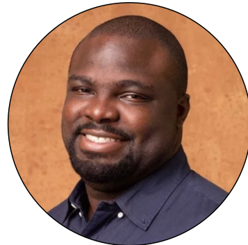
Iyinoluwa Aboyeji Co-founder of Andela and Future Africa, whose venture ecosystem investments continued powering African tech in 2025.