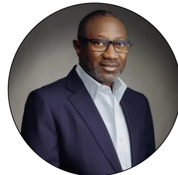
Femi Otedola Business magnate and philanthropist whose energy and education initiatives continued shaping Nigeria's corporate landscape.