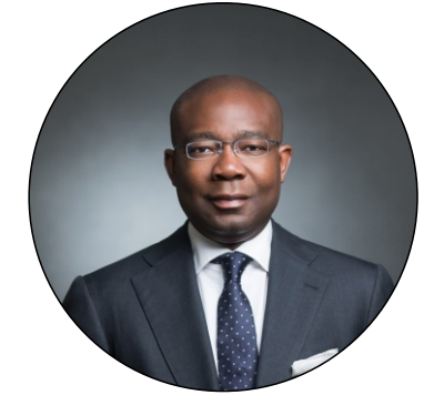
Aigboje Aig-Imoukhuede Co-founder of Access Holdings and Aig-Imoukhuede Foundation, promoting good governance and leadership training in Africa.