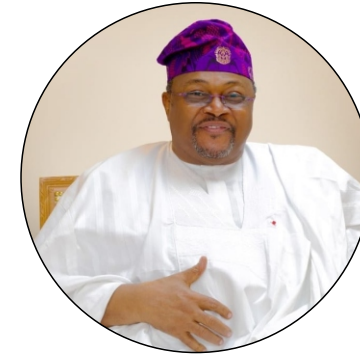
Mike Adenuga Founder of Globacom, whose telecommunications reach remains pivotal to Nigeria's digital inclusion story.