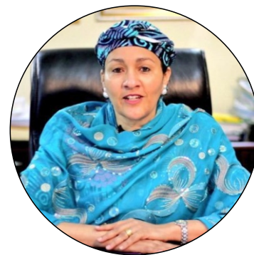
Amina J. Mohammed Deputy Secretary-General of the United Nations, advancing the global sustainable development agenda.