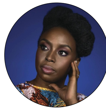
Chimamanda Ngozi Adichie

Gen-Z sensation whose 2025 global hits redefined Afrobeats' appeal among young audiences.