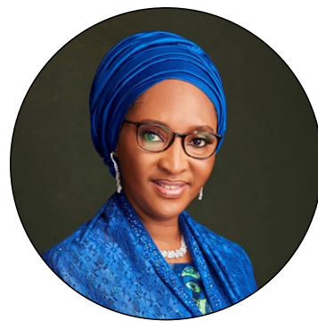
Zainab Shamsuna Ahmed Economist and fiscal-policy expert recognized for her continued role in economic reform and financial governance.