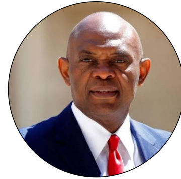
Tony Elumelu Economist and philanthropist empowering thousands of African entrepreneurs through the Tony Elumelu Foundation's 2025 cohort.