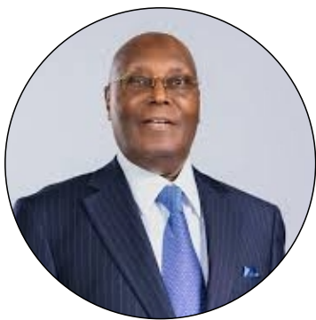
Atiku Abubakar Businessman and political figure maintaining significant influence over Nigeria's democratic and economic discourse.