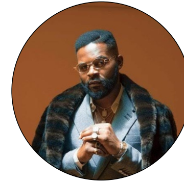
Falz (Folarin Falana)

Chef and entrepreneur whose 2025 ventures expanded Nigerian cuisine's global recognition.