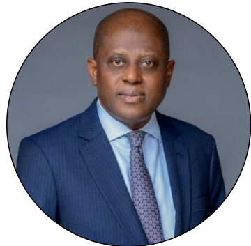
Olayemi Cardoso Governor of the Central Bank of Nigeria, whose 2025 monetary reforms and fiscal-stability policies strengthened investor confidence and steered Nigeria's economy toward renewed growth.