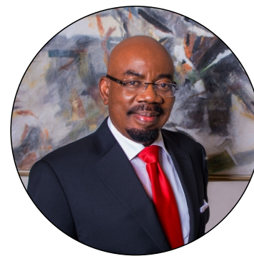
Jim Ovia Founder and Chairman of Zenith Bank, whose scholarship foundation and digital-economy advocacy continue transforming Nigeria's private sector.