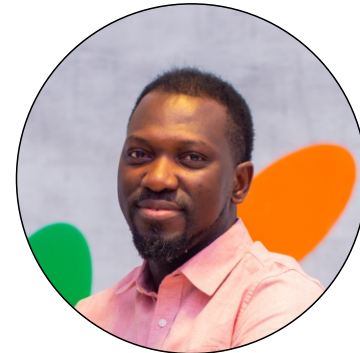
Olugbenga Agboola CEO of Flutterwave, driving fintech innovation and cross-border payments across 30+ African markets in 2025.